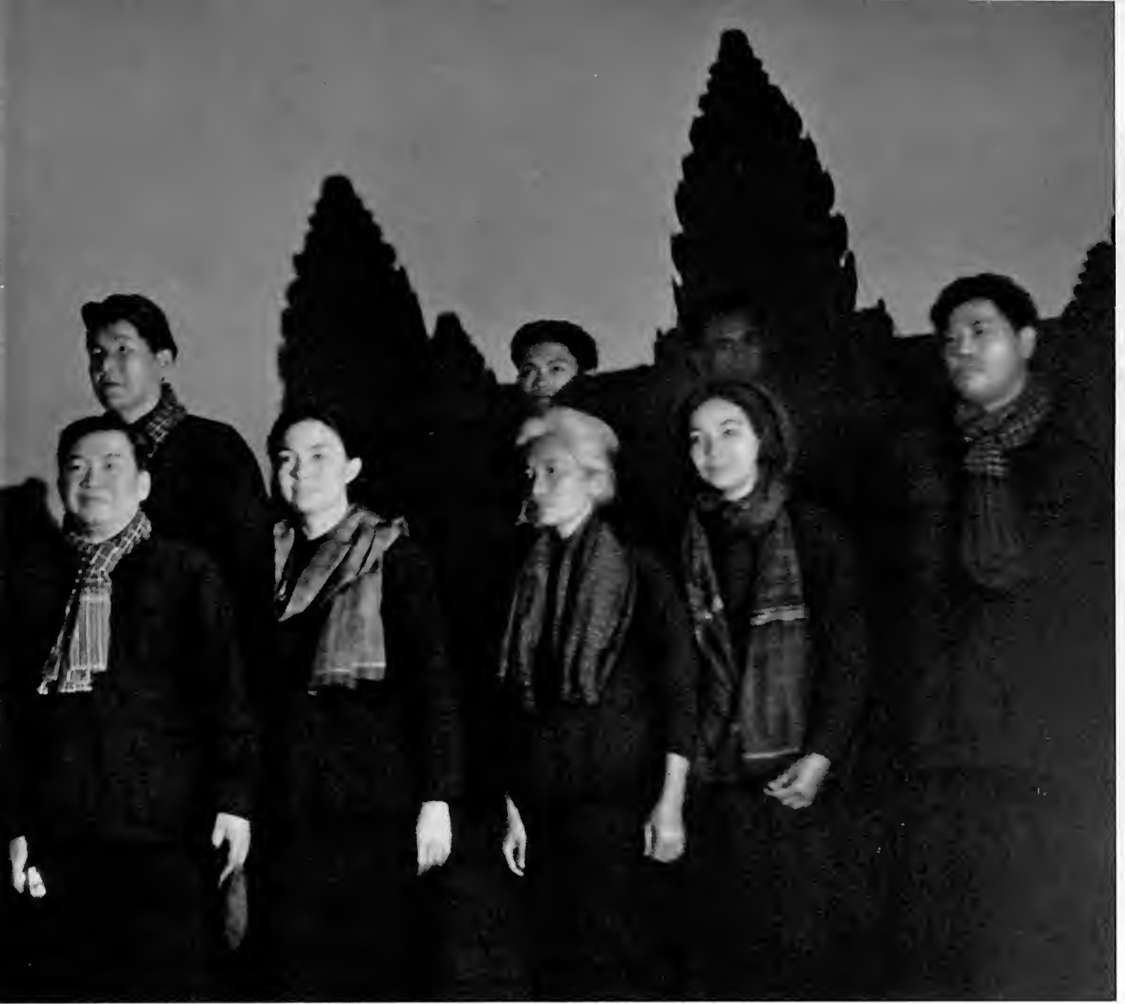
At a temple at Siem Reap Province.